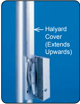
← Halyard Cover (Extends Upwards)