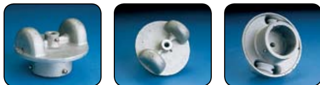
For External Halyard Poles • Cap Style • Stationary • Double Pulley