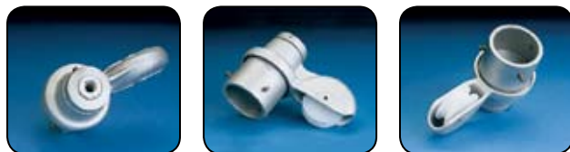
For External Halyard Poles • Cap Style • Revolving • Single Pulley